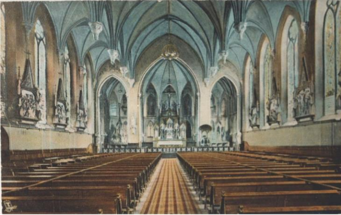
Original design from 1890